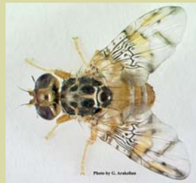
Mediterranean fruit fly