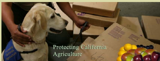
Protecting California Agriculture

Visit our website at http://acwm.lacounty.gov