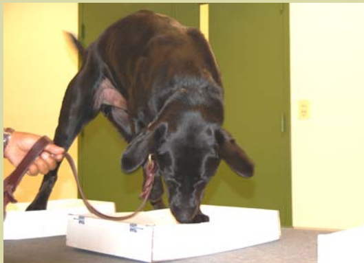
Detector Dog Tahoe finds an unmarked parcel that contains fruit

We have seen an increase in the number of newly introduced exotic insects such as Asian citrus psyllid, light brown apple moth, and Mediterranean fruit fly. An infestation of such pests could cost California millions of dollars in crop and job losses, increased pesticide use, and quarantines that impact trade. Dog teams throughout the state have detected numerous pests and diseases, demonstrating their effectiveness in the work of pest detection and exclusion.